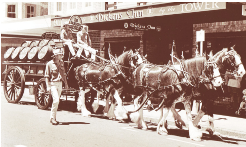
Our first beer delivery—opening day 1st December 1995

The Dickens Inn opened on the 1st December 1995 and has been open every day since with only one or two exceptions.