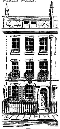
Dickens House Museum London